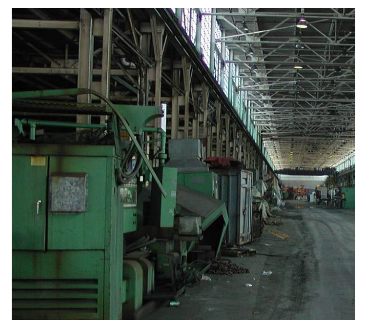
Facility at 4000 Redbank Road prior to remediation and demolition

of the Village's total land area. The developer and the Redevelopment Authority reworked the site plan several times to increase its value. The end result was about 30,000 SF less of building space but an additional $2 million in property value to the site. The $60 million, mixed-use development called Red Bank Village is anchored by a 151,908-square-foot Wal-Mart that opened in October 2009. The site has an additional 12,600 square feet of retail, and over 100,000 square feet of office space, housing a law firm and an animal hospital as well as several outlots.