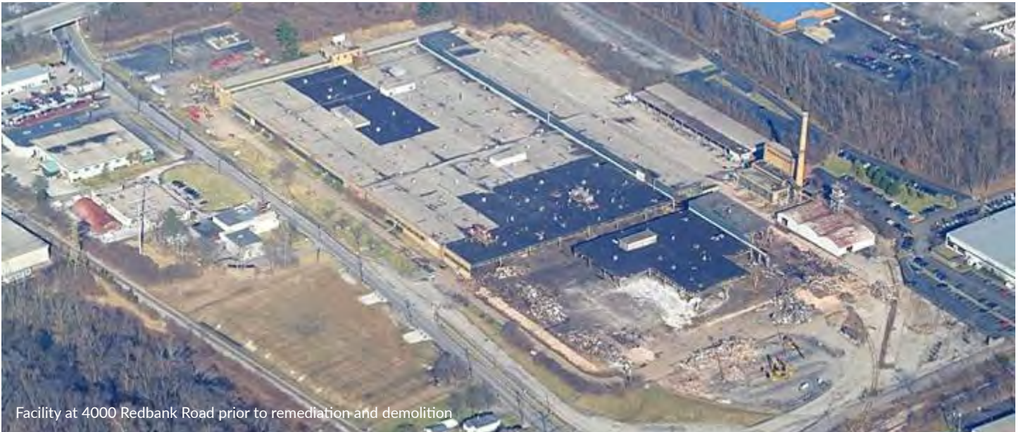
Facility at 4000 Redbank Road prior to remediation and demolition

Site of a massive former Ford Transmission Plant, the Redevelopment Authority was awarded Clean Ohio Revitalization Funds and oversaw asbestos abatement, building remediation, and soil and groundwater remediation. This site represents 7% of the Village of Fairfax's total area and has since been redeveloped into Red Bank Village, a mixed-use development.