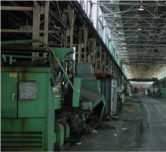
Facility at 4000 Redbank Road prior to remediation and demolition